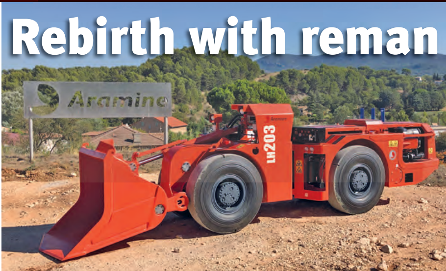
Sandvik LH203 LHD after a full Aramine reman