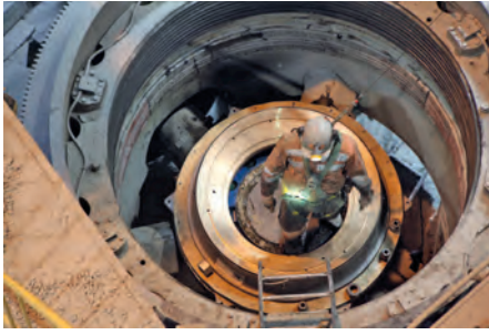
Installing the upgraded Symons crusher at Codelco's Division Andina

adjustment made, caused a 30-minute interruption (on average) to the process. This interruption added up to two hours of lost time a day (corresponding to 8.3%). Today, after the upgrades were carried out, they are still adjusted twice per shift, but the daily impact is only 20 minutes a day, ie an increase of 7% in the equipment's usage.