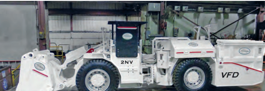
Before and After - images of an LHD rebuild where electric drives and battery electric specialist Saminco converted the machine from diesel to battery power for the lead rebuilder, client Highland Machinery

mining conditions but then opt to convert the rest. Of course any conversion is a challenge, especially when it comes to the resulting weight displacement and in space terms where to put the traction motors, hydraulic pump motors etc, but we have some of the broadest experience in the industry.”